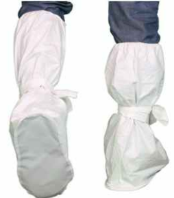
Disposable Booties DBS 1