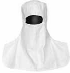
Disposable Monkey Cap with Tying Belt DMC 1