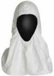
Disposable Hood DHD 1