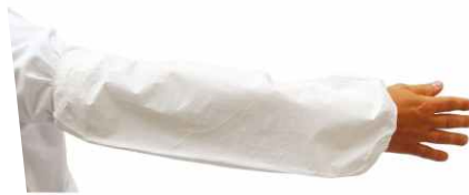
Disposable Arm Sleeves DHS 1